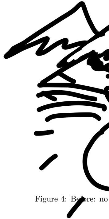
Figure 4: Before: no